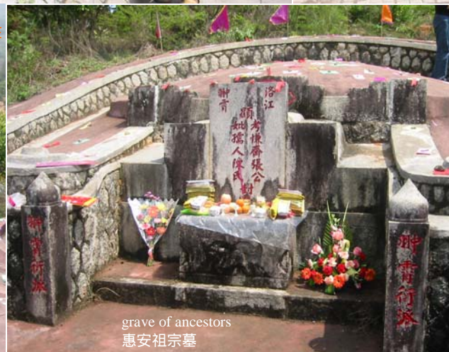
grave of ancestors 惠安祖墓