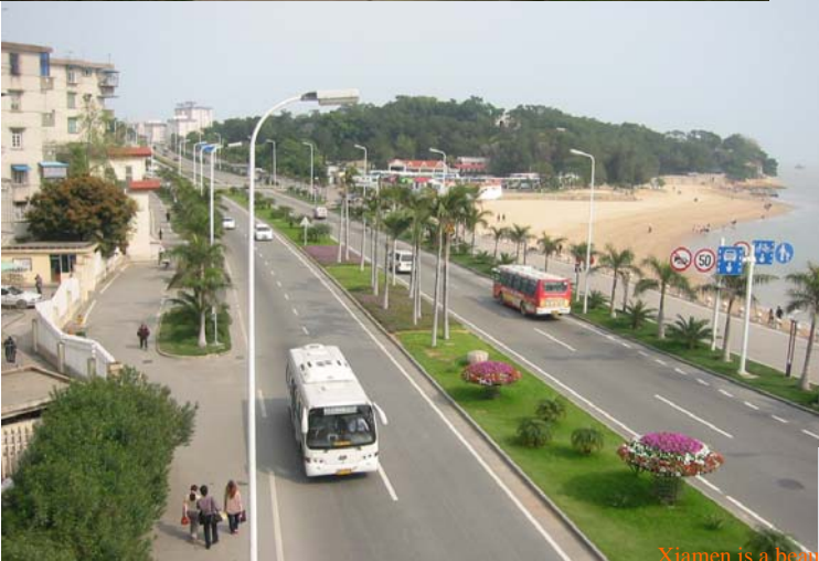
Xiamen is a beautiful seaside city 厦门是个美丽的海岛城市