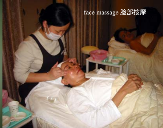
face massage 脸部按摩