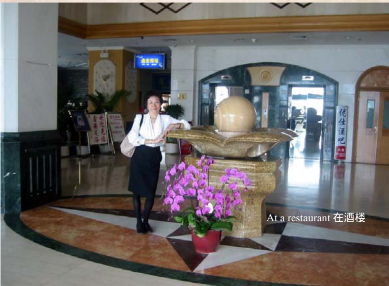
At a restaurant 在酒楼