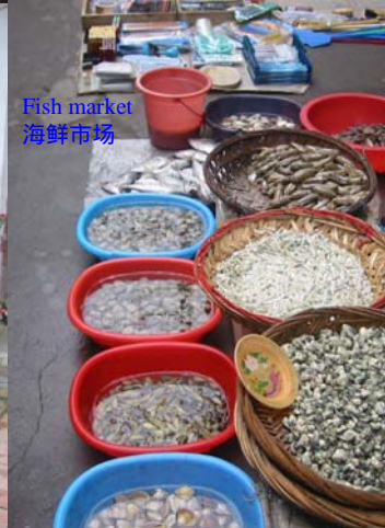
Fish market 海鲜市场