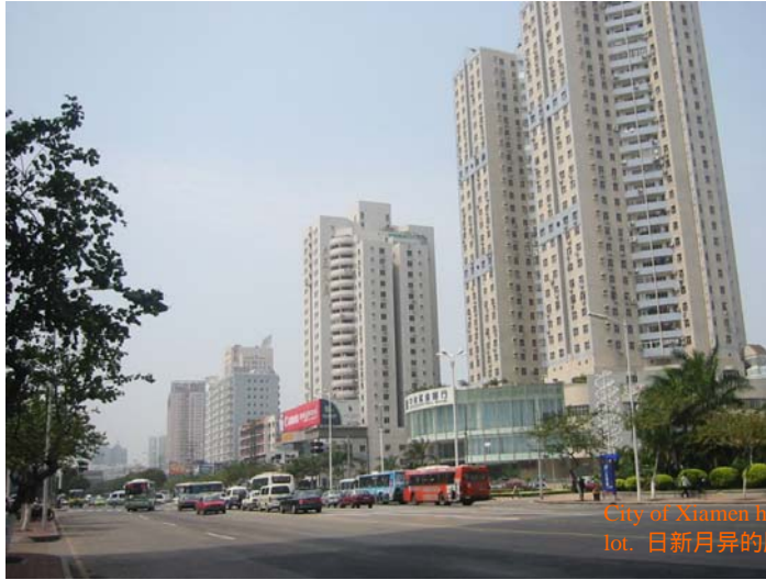
City of Xiamen has changed a lot. 日新月异的厦门市