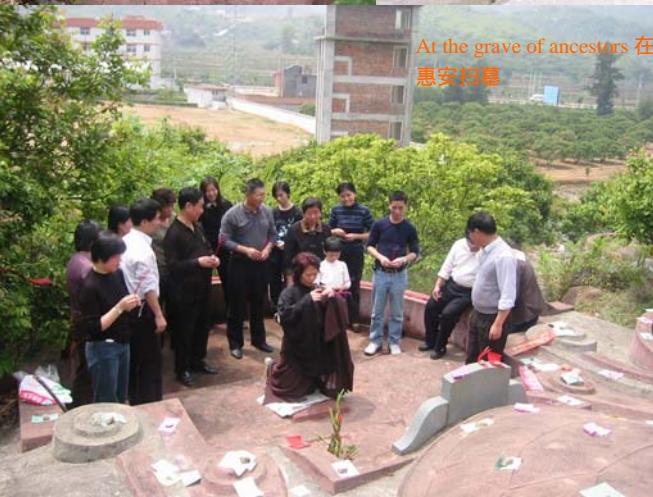
At the grave of ancestors 在惠安扫墓