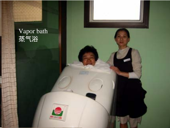
Vapor bath 蒸气浴