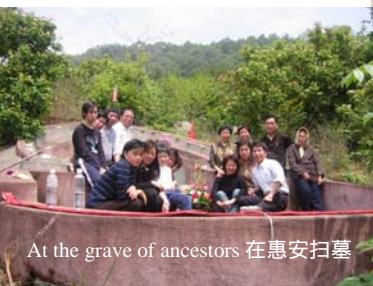
At the grave of ancestors 在惠安扫墓