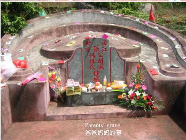
Parents' grave 爸爸妈妈的墓