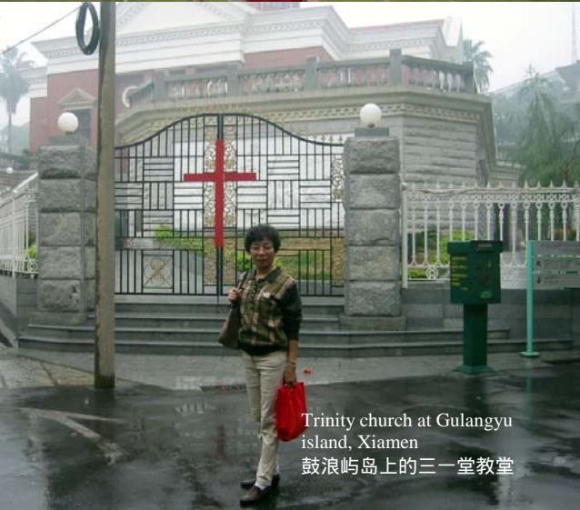
Trinity church at Gulangyu island, Xiamen 鼓浪屿上的三一教堂