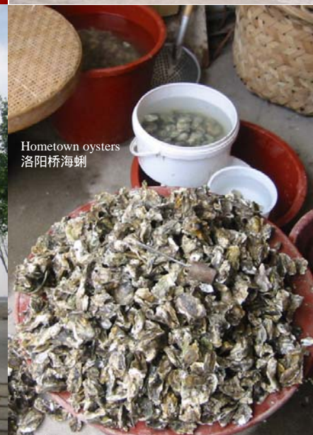
Hometown oysters 洛阳桥海蛎