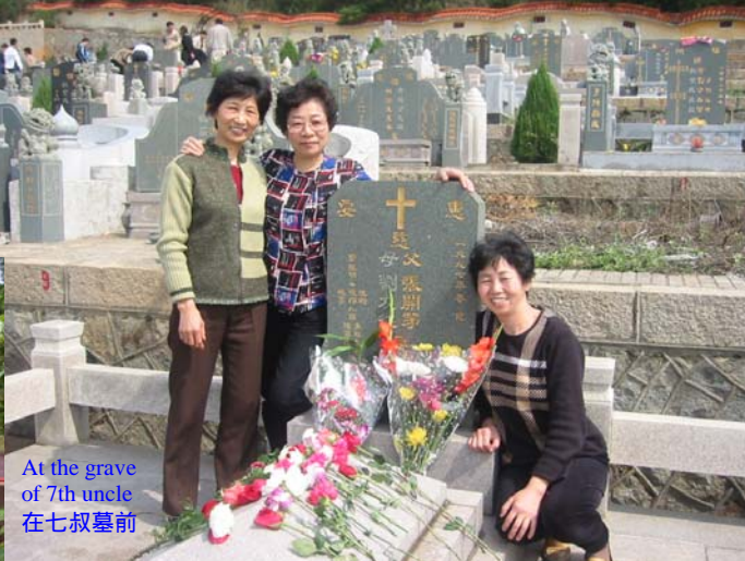
At the grave of 7th uncle 在七叔墓前