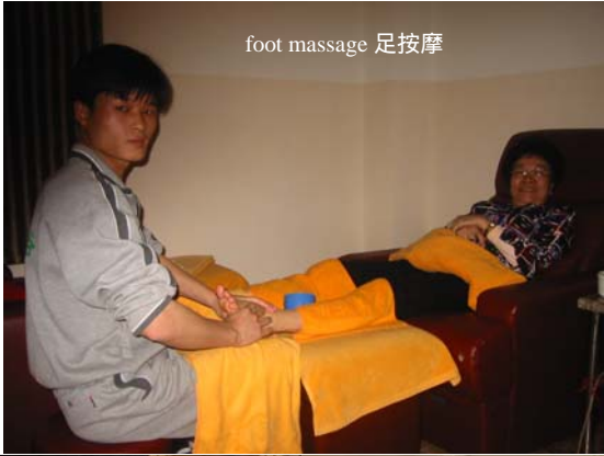
foot massage 足按摩