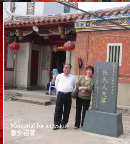
Memorial for ancestors 惠安祖厝