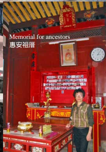
Memorial for ancestors 惠安祖厝