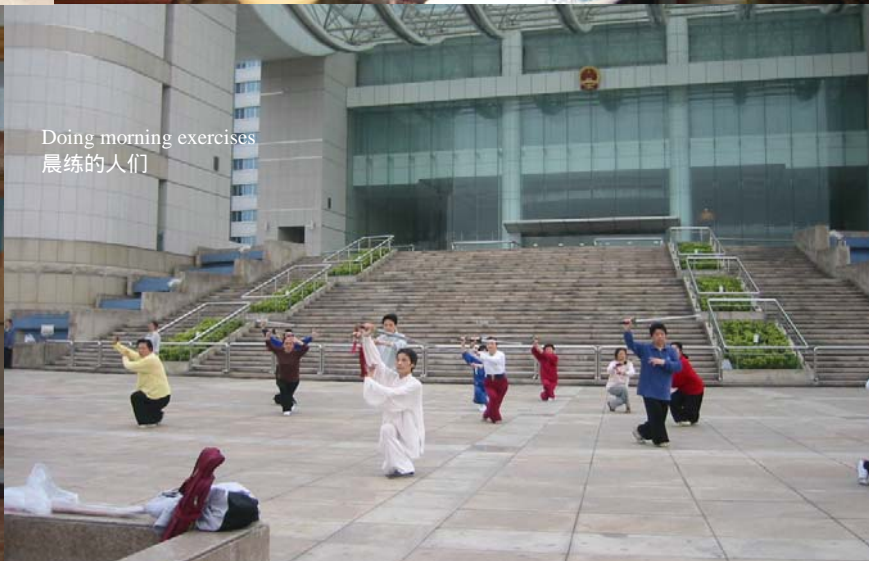
Doing morning exercises 晨练的人们