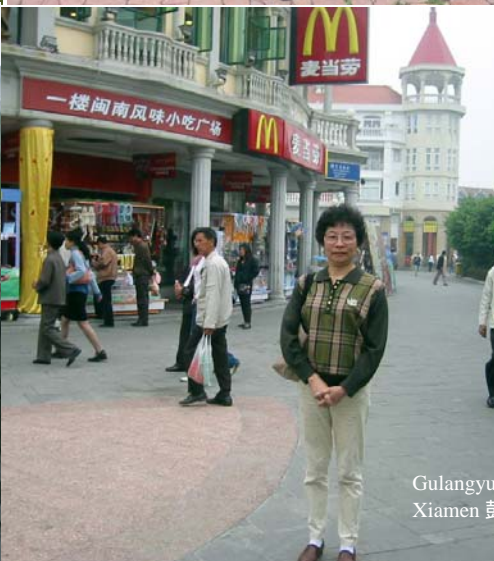
Gulangyu island, Xiamen 鼓浪屿岛