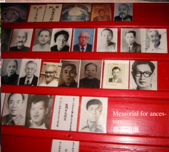
Memorial for ancestors 惠安祖厝